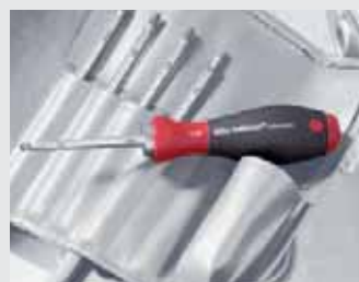
The Wiha SYSTEM 6 range is the compact all-rounder for different applications.

With the Wiha SYSTEM 6 series you always have the right tool on hand for a wide range of applications - ideal for industry, trade and the ambitious handymen.