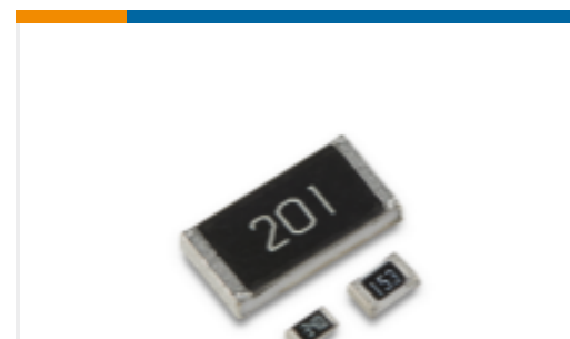
TE Part #3-2176325-5 CRGP 0402 6K8 1%