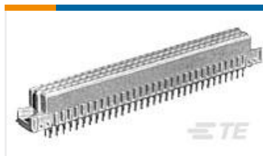
TE Part #5535032-4 ASSY,RECEPTACLE,EUROCARD,TYPE