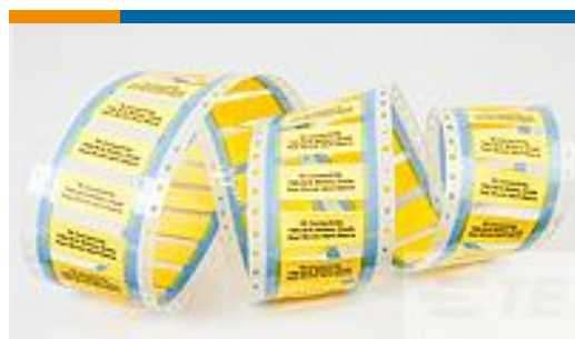
TE Part #6418370001 TMS-SCE-1/8-2.0-4