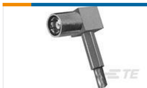
TE Part #5415484-2 PLUG,CBL,RTANG,MINI-75 OHM SMB