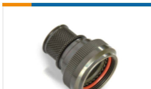
TE Part #EK4830-000 91H1-13-08-1-B-HE200