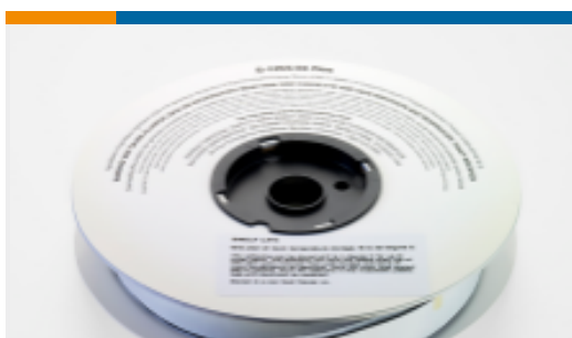
TE Part #195133-000 S1255-04-3/4X100FT