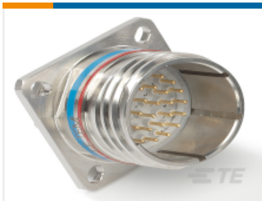
TE Part #DTS20F11-35SN D38999: Square Flange, 11-35 insert