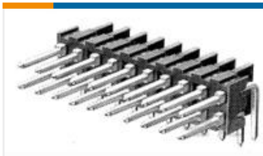
TE Part #87230-6 12 MODII HDR DRRA UNSHRD .100