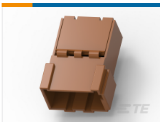
TE Part #969191-4 FLA-STE-GEH2,8 8P