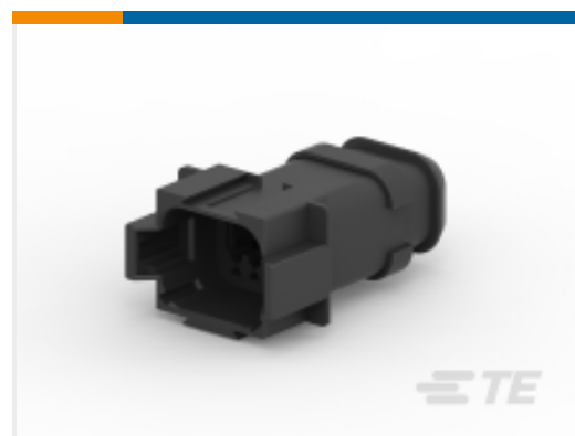
TE Part #DT04-08PA-CE09 REC, 8P, BLK, E, XCAP, A