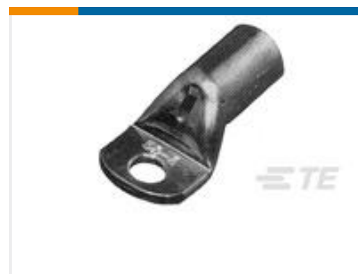
TE Part #710032-6 XCT 6-8