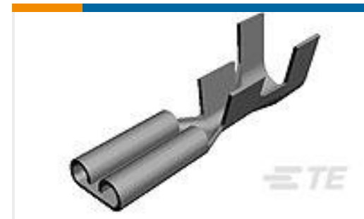
TE Part #180423-2 110 FASTON, REC., 20-16 AWG, TPBR