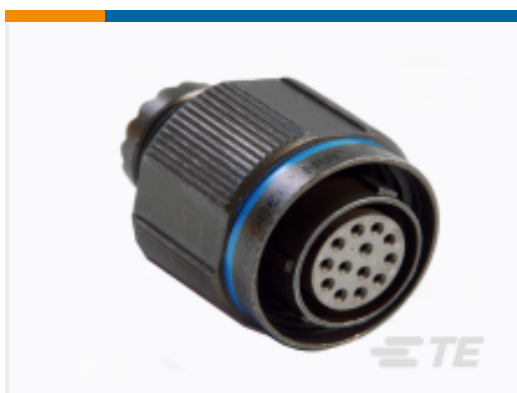
TE Part #ZPF000000000016997 DTS 26 F 17-35 BN sup by YDTS26F17-35BN*