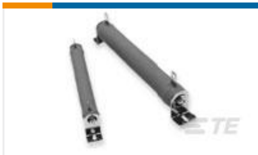
TE Part #1879455-2 TE 1500W 1R2.5% Bracket