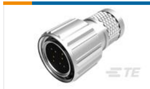
TE Part #2102353-1 CeeLok FAS-T, Plug Kit, Ni