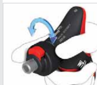
Finely toothed, switchable ratchet

The LiftUp 25 magazine bit holder saves space by storing 25mm bits in its handle. At the press of a button, the bit magazine at the handle end comes out and makes the bits available for removal.