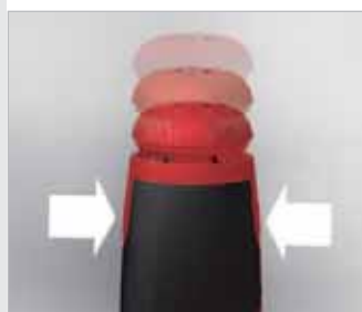
Bit magazine opens at the press of a button.