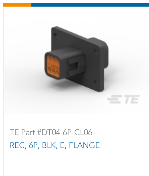
TE Part #DT04-6P-CL06 REC, 6P, BLK, E, FLANGE