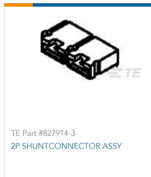
TE Part #827914-3 2P SHUNTCONNECTOR ASSY