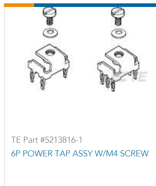
TE Part #5213816-1 6P POWER TAP ASSY W/M4 SCREW