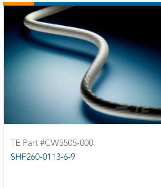
TE Part #CW5505-000 SHF260-0113-6-9