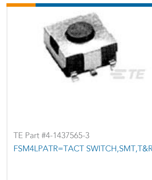
TE Part #4-1437565-3 FSM4LPATR=TACT SWITCH,SMT,T&R