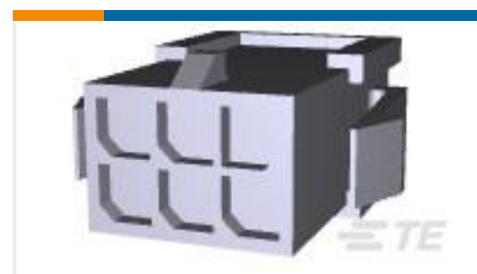
TE Part #794615-6 PANEL MT DBL ROW HSG 6 POS