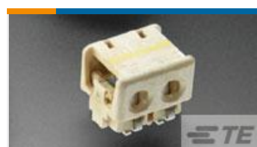
TE Part #3-2106431-2 Connector, SMT-IDC PASS THRU, 2 POS, 24