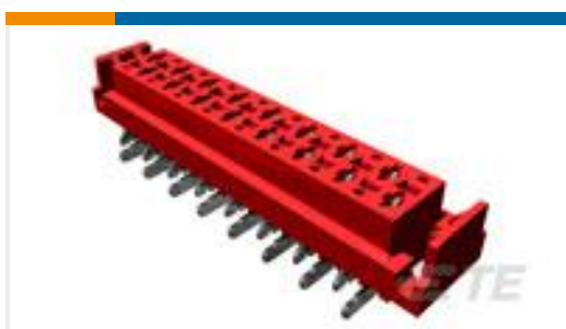
TE Part #8-338069-0 MICRO-MATCH SMD FTE