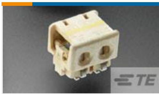
TE Part # 3-2106431-2 Connector, SMT-IDC PASS THRU, 2 POS, 24