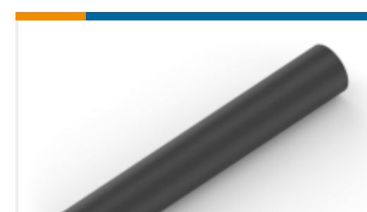
TE Part #NB11022001 ATUM-4/1-0-STK