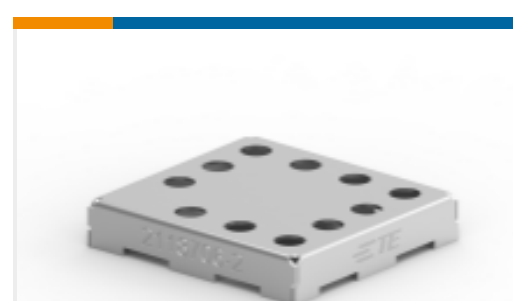
TE Part #2118706-2 1 PC STD SHIELD, CRS-13.66X12.70X2. 54MM