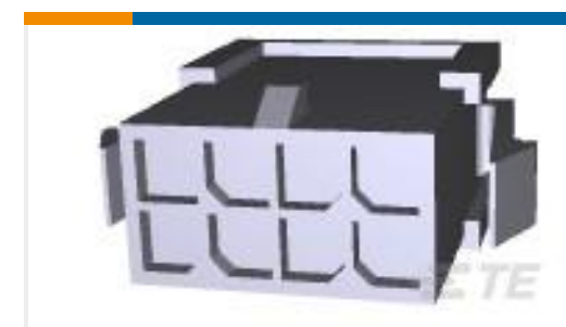
TE Part #794615-8 PANEL MT DBL ROW HSG 8 POS