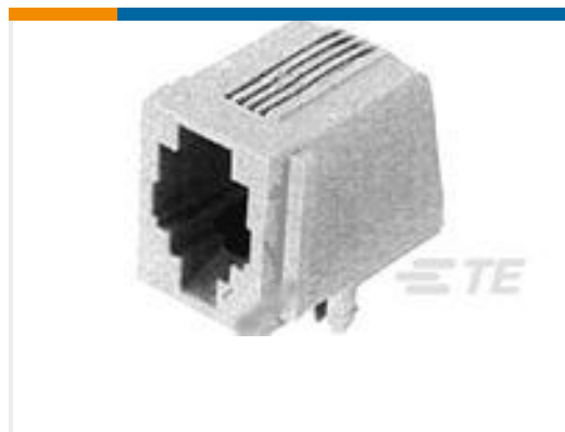
TE Part #5520470-3 MJ,R/A,6P/6C,TRAY PACK