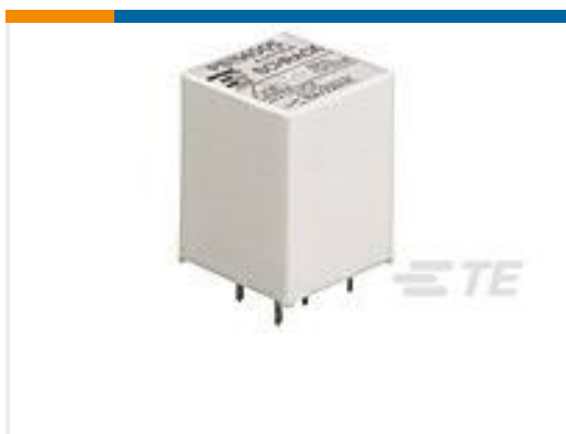
TE Part #3-1415030-1 PB134024