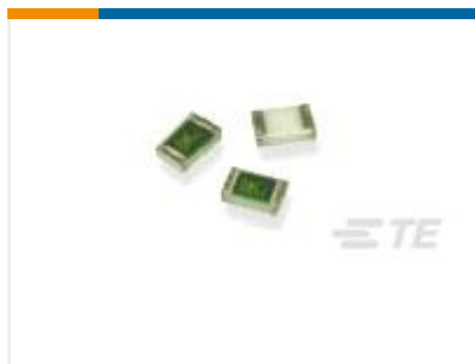
TE Part #8-2176088-3 RP 1J 0.166W 6K49 0.1% 25PPM 1K RL