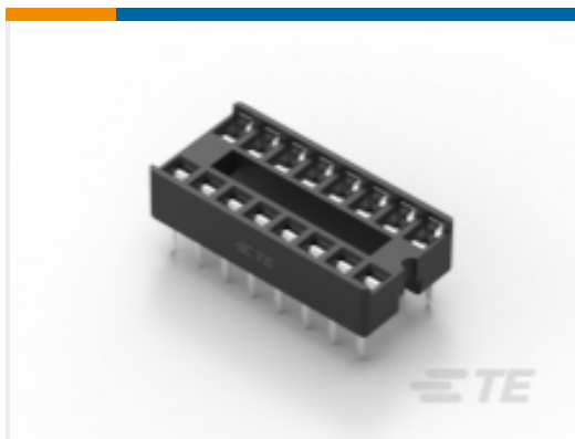
TE Part #1-2199298-6 DIP Socket: Low Profile, Stamped & Formed, Open, Tin