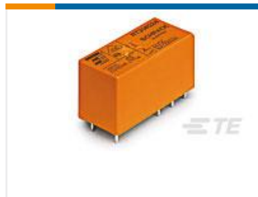
TE Part #3-1393240-5 RT33L024