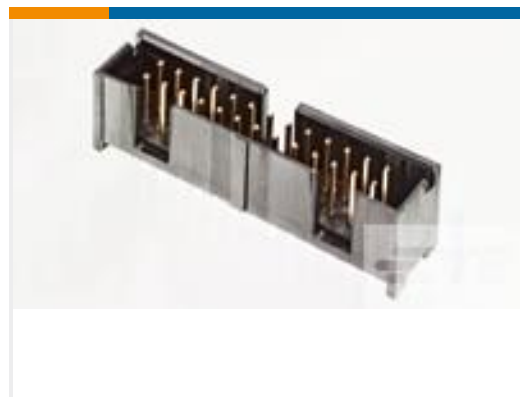
TE Part #5103308-7 A/L LOW PRO HDR 34P VERT BLACK