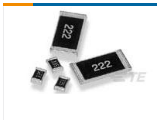
TE Part #2176177-5 CRGH0603 1% 330R 0.2W