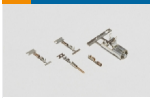
Wire-to-Board Connector Contacts(6)