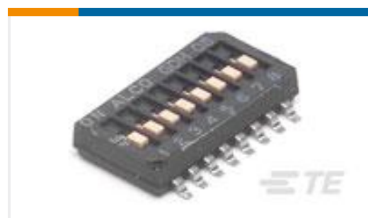
TE Part #1571983-3 GDH02STR04=DIP SWITCH