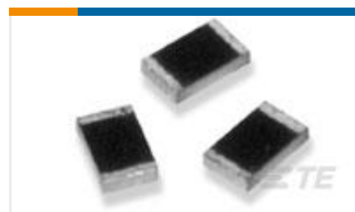
TE Part #1625867-2 RP 1J 0.166W 10K 0.1% 25PPM 1K RL