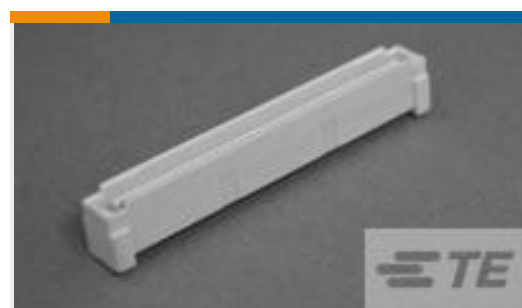
TE Part #3-5177986-2 0.8FH,P08H.5,060,08/Sn,TR,SC