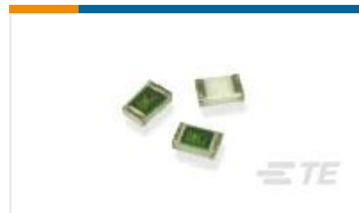
TE Part #3-1614351-0 RN 0603 200R 0.1% 10PPM CUT LE