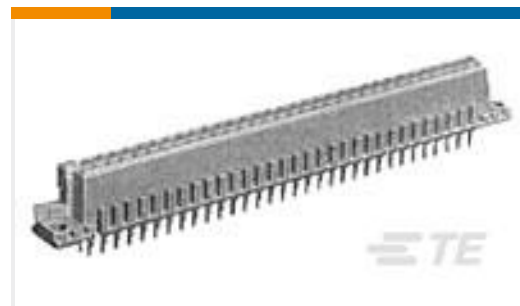
TE Part #650861-4 064 EURO TYPE B RECEPT ST ASSY