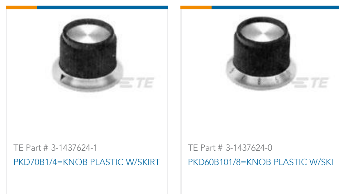
TE Part # 3-1437624-1 PKD70B1/4=KNOB PLASTIC W/SKIRT