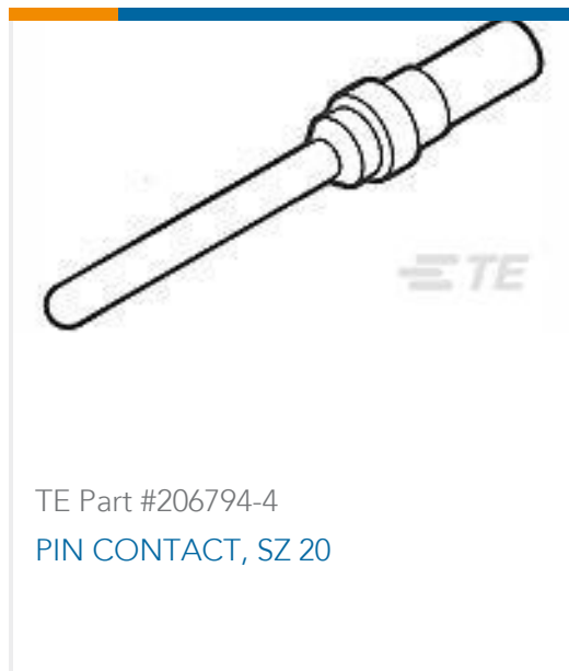
TE Part #206794-4 PIN CONTACT, SZ 20