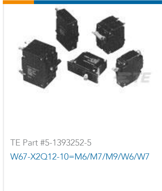
TE Part #5-1393252-5 W67-X2Q12-10=M6/M7/M9/W6/W7