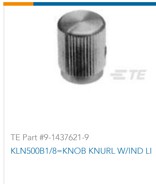
TE Part #9-1437621-9 KLN500B1/8=KNOB KNURL W/IND LI