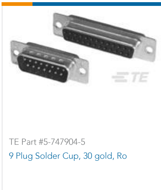
TE Part #5-747904-5 9 Plug Solder Cup, 30 gold, Ro