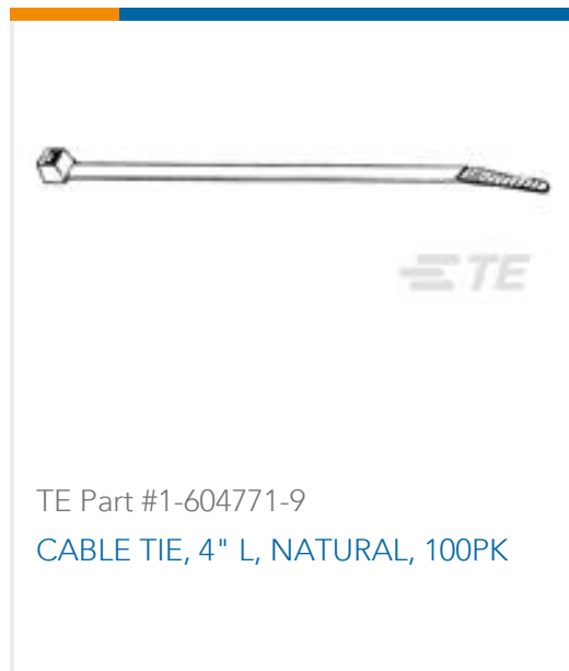
TE Part #1-604771-9 CABLE TIE, 4" L, NATURAL, 100PK