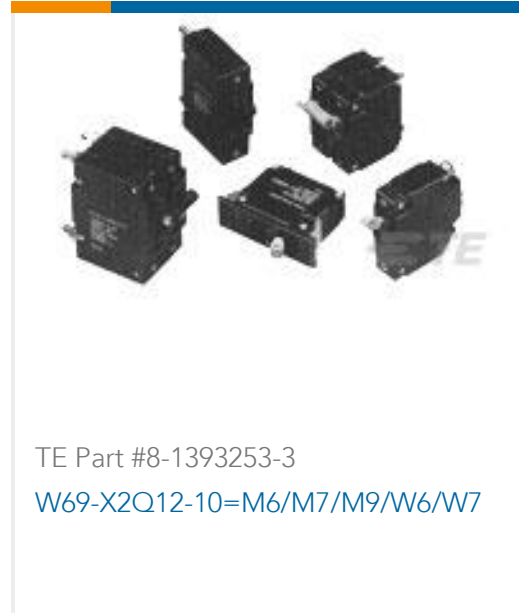
TE Part #8-1393253-3 W69-X2Q12-10=M6/M7/M9/W6/W7