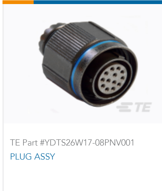
TE Part #YDTS26W17-08PNV001 PLUG ASSY