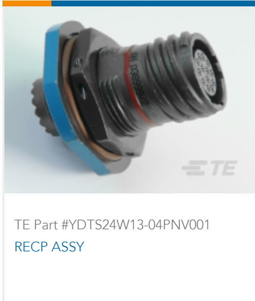
TE Part #YDTS24W13-04PNV001 RECP ASSY