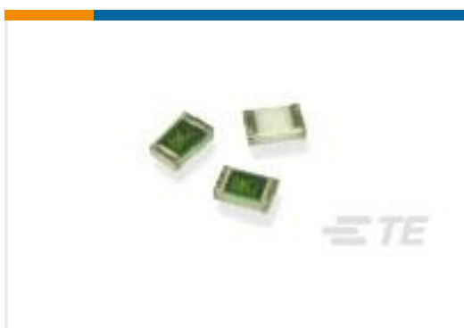
TE Part #6-2176091-2 RP 2A 0.25W 255R 0.1% 25PPM 1K RL