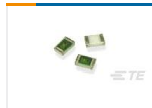
TE Part #6-2176091-1 RP 2A 0.25W 249R 0.1% 25PPM 1K RL