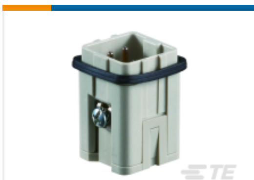
TE Part #T2010043101-000 HA-004-MS