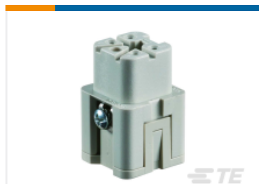
TE Part #T2010043201-000 HA-004-FS