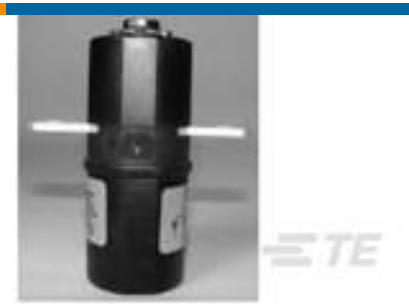
TE Part #7-1616941-3 K400B3C05=CONTACTOR SPST DB 400 AMP 28 V