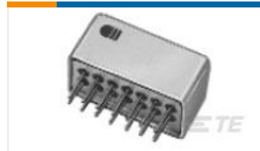
TE Part #1-1617084-7 SRBW-4C-24G = SR RELAY