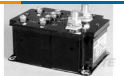
TE Part #1616060-1 A931F=CONTACTOR, SPST-NC, 600A