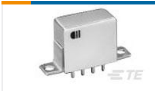
TE Part #3-1617004-2 B07D692BZ2-0011 = M5757/23-001