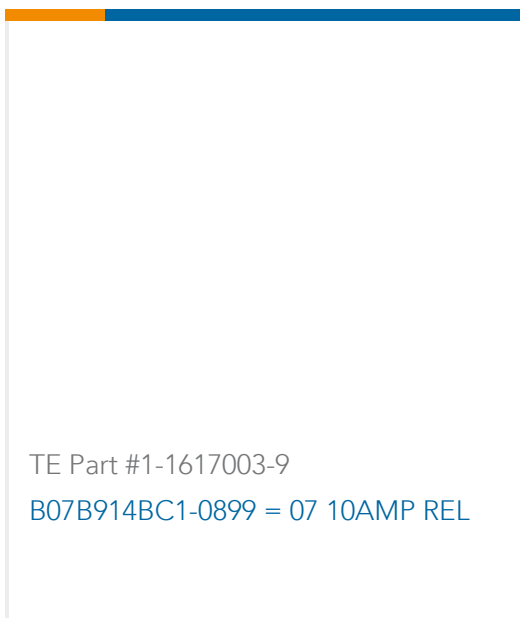
TE Part #1-1617003-9 B07B914BC1-0899 = 07 10AMP REL