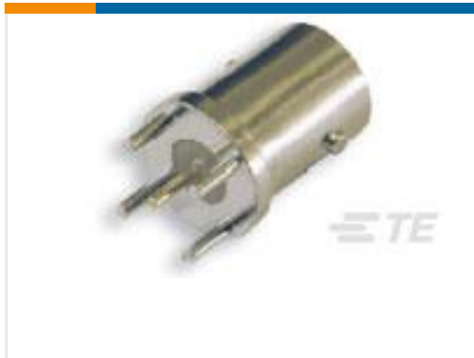
TE Part #5-1634503-3 BNC Str PCB Skt 75Ohm Nickel Pltd