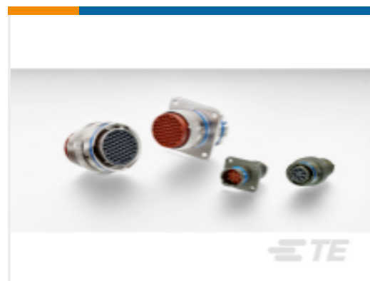
TE Part #YAFD50-8-33SNC1270 RECP ASSY