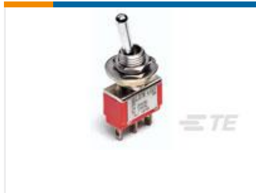
TE Part #3-1825139-9 A211SYZQ04