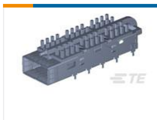
TE Part #1888972-3 Cage Assy PCI Hsink LP QSFP Thru Bezel