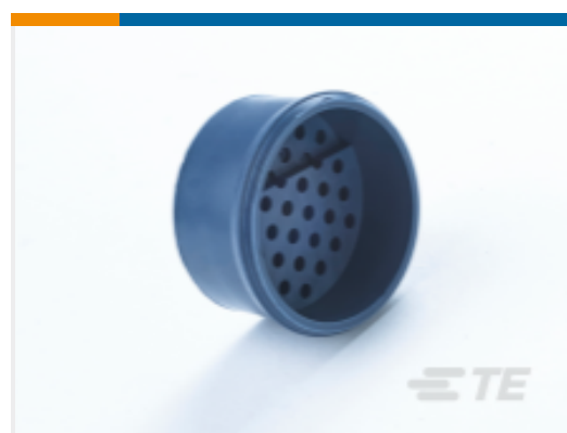
TE Part #Y5015-000000077958 WIRE SEAL GROMMET - CIRP