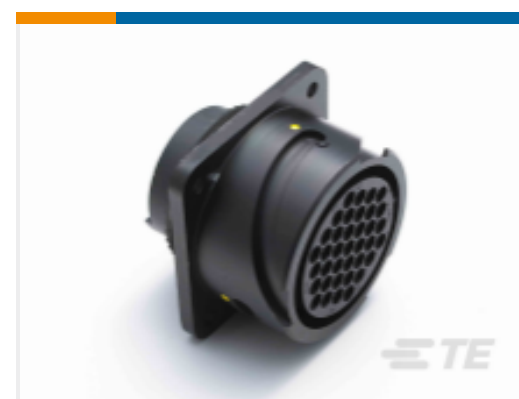
TE Part #Y5015-000000004245 FIXED, REAR MOUNT SOCKET CONNECTOR