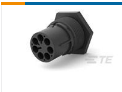
TE Part #2213394-1 NECTOR M PIN HOUSING, PANEL, 5P, CODE A