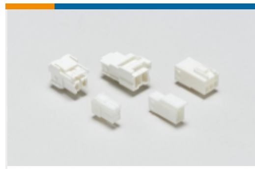
Rectangular Power Connectors(3)