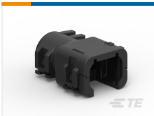
TE Part #2292797-3 AS16 BACKSHELL, 2P PLUG, NC08, MC