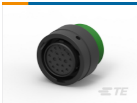
TE Part #YHDP26-18-20SNL024 PLG, 20P, BLK, N, WTHD, 16/20, S