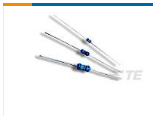
TE Part #6-1879026-5 YR1 0.1% 35R7