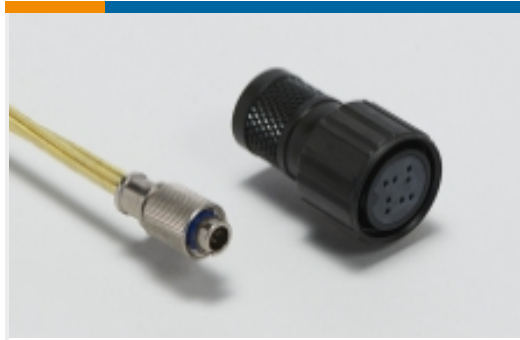
Standard Circular Connectors(124)