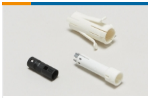
Plug & Socket Lighting Connector Accessories(1)