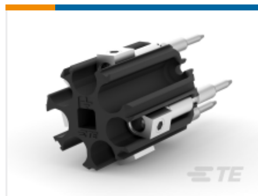
TE Part #1-2213234-1 NECTOR M FI PIN ASSY, FH, 5P