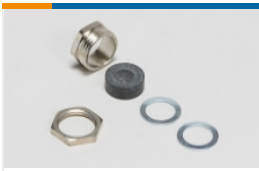
Circular Connector Hardware(1)