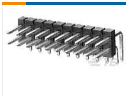
TE Part #5-826662-0 50P AMPMODU II STIFT LEI