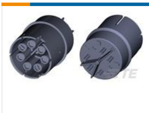
TE Part #293696-1 NECTOR M SKT CONN PCB 5P CODE A