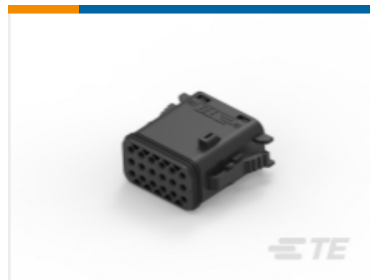
TE Part #2600047-1 18CCT PLUG BLACK KEYING A W /SEAL