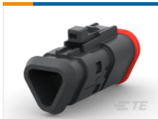
TE Part #2-2303816-3 DT06-3S-TN82, PLG, 3P, BLK, N, SNAPXCAP