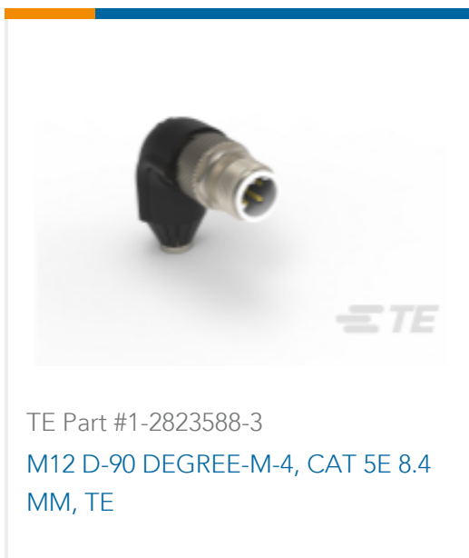
TE Part #1-2823588-3 M12 D-90 DEGREE-M-4, CAT 5E 8.4 MM, TE