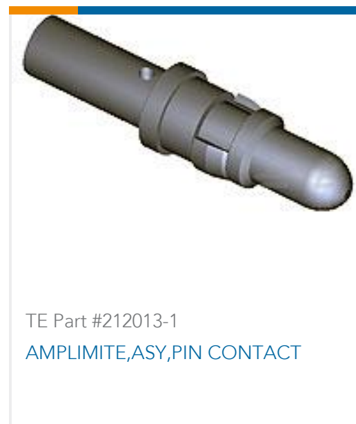
TE Part #212013-1 AMPLIMITE,ASY,PIN CONTACT