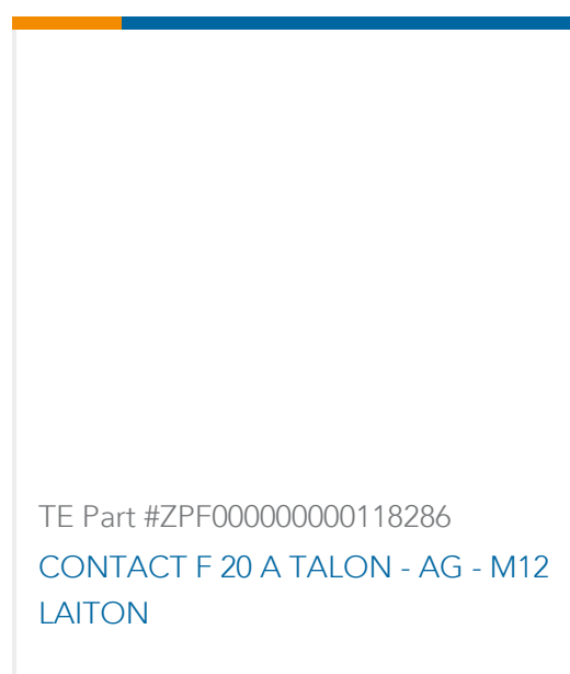
TE Part #ZPF000000000118286 CONTACT F 20 A TALON - AG - M12 LAITON