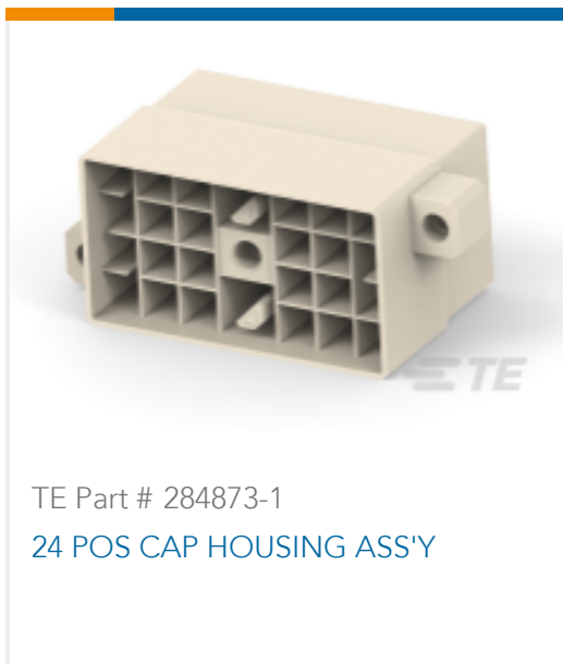
TE Part # 284873-1 24 POS CAP HOUSING ASS'Y