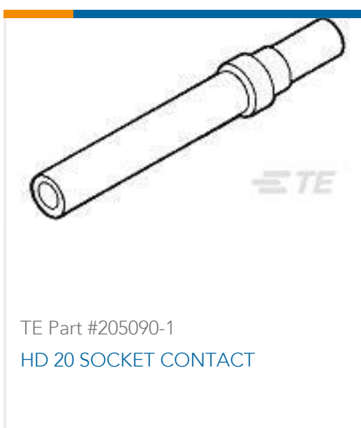
TE Part #205090-1 HD 20 SOCKET CONTACT