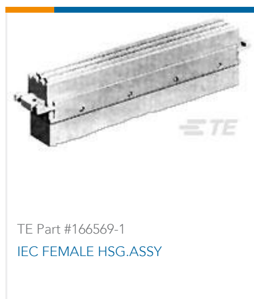
TE Part #166569-1 IEC FEMALE HSG.ASSY