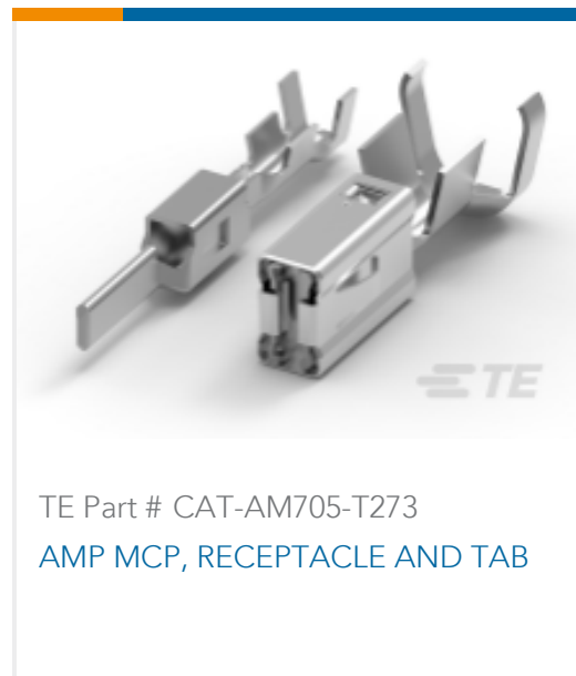
TE Part # CAT-AM705-T273 AMP MCP, RECEPTACLE AND TAB