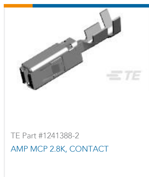
TE Part #1241388-2 AMP MCP 2.8K, CONTACT