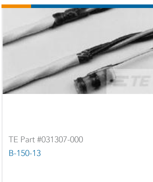
TE Part #031307-000 B-150-13