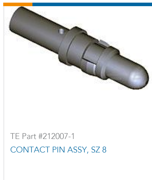
TE Part #212007-1 CONTACT PIN ASSY, SZ 8