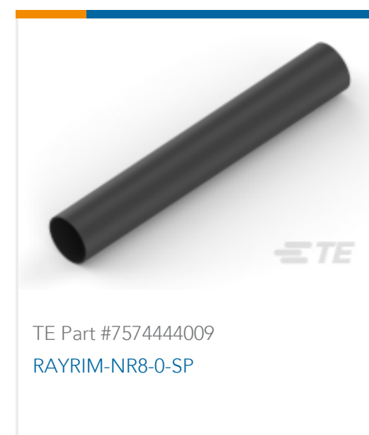
TE Part #7574444009 RAYRIM-NR8-0-SP