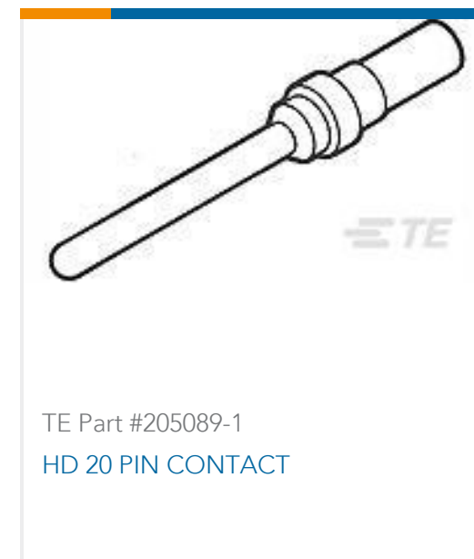
TE Part #205089-1 HD 20 PIN CONTACT