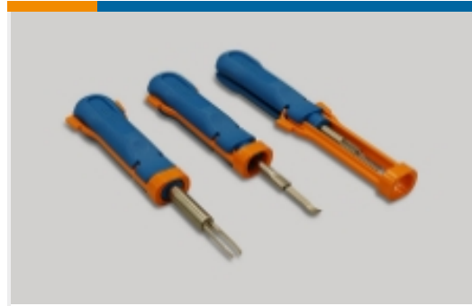
Insertion & Extraction Tools(4)