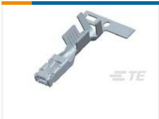
TE Part #1719838-1 MCON 2.8 TERMINAL - LL