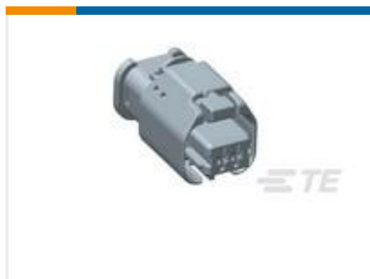
TE Part #1-1801175-6 2W RECEPTACLE HP CONNECTOR BROWN