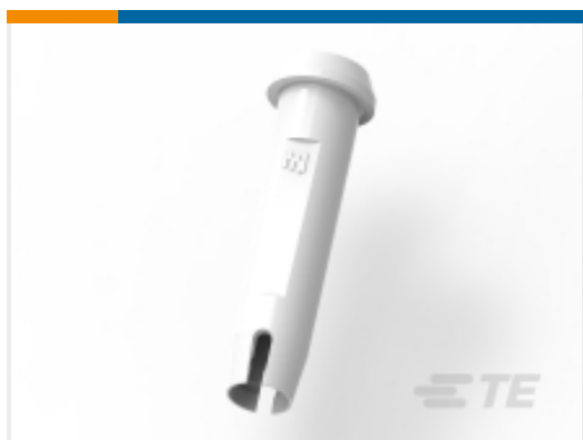
TE Part #284818-2 1 WAYS CONNECTOR F.GLOW PLUG - RED VERS.