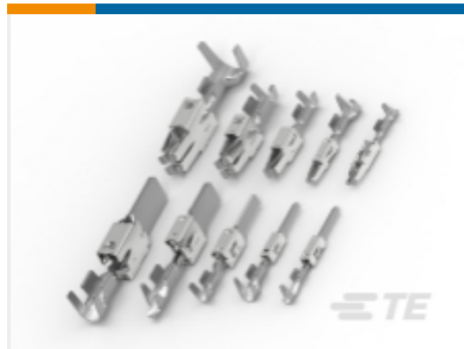
TE Part #962876-5 TIMER, RECEPTACLE AND TAB