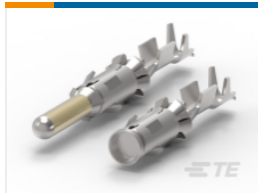
TE Part #962954-1 ROUND CONNECTOR SYSTEM, PIN AND SOCKET