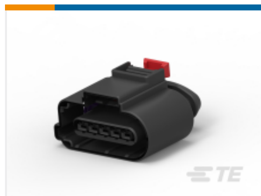
TE Part #284879-3 AMP MCP, SEALED CONNECTOR HOUSING