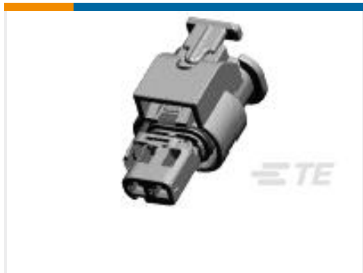
TE Part #1-1718888-1 2POS, MCON 1.2 LL REC SEALED