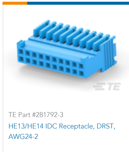
TE Part #281792-3 HE13/HE14 IDC Receptacle, DRST, AWG24-2