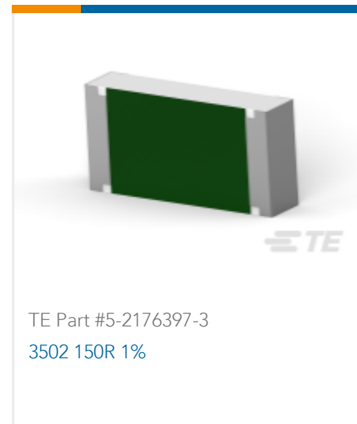
TE Part #5-2176397-3 3502 150R 1%