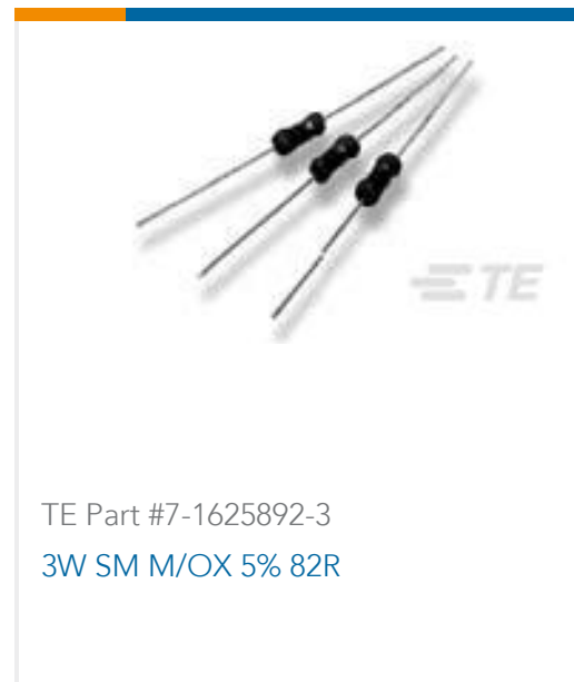
TE Part #7-1625892-3 3W SM M/OX 5% 82R