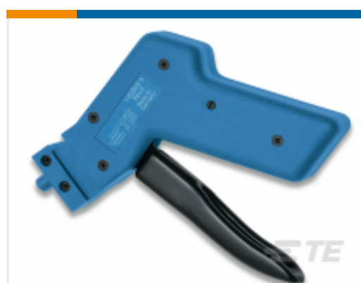
TE Part # 1-528015-6 PISTOL GRIP HANDLE