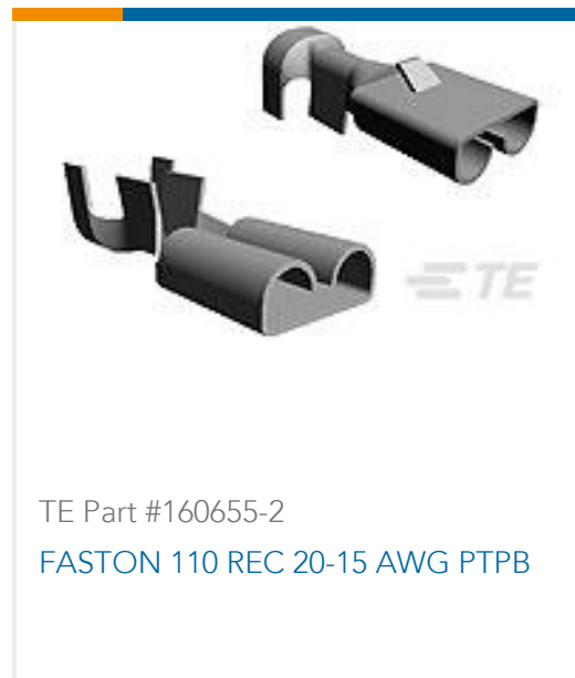
TE Part #160655-2 FASTON 110 REC 20-15 AWG PTPB