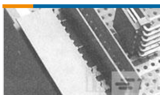
TE Part # 281698-6 HEADER HE14 RA 6 P