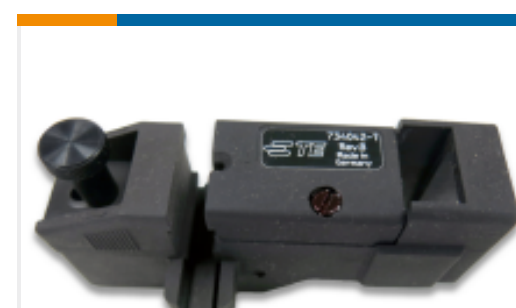
TE Part # 734042-1 HEAD, HE-14, 180 DEGREE

Also in the Series | AMPMODU HE 13/HE 14