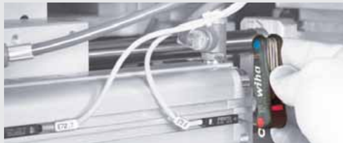
Small but effective. The Mini PocketStar from Wiha is the smart helper for service engineers and for DIY use.

Regardless of whether replacing a proximity switch or pneumatic control unit, or whether adjusting the sensitivity of a light barrier. With the Mini PocketStar, all keys are within reach.