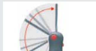
The 180° stop limit when working on applications with higher safety requirements puts an end to trapped fingers.