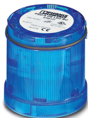
LED permanent light element, 24 V AC/DC, blue

Please be informed that the data shown in this PDF Document is generated from our Online Catalog. Please find the complete data in the user's documentation. Our General Terms of Use for Downloads are valid ( http://phoenixcontact.com/download )