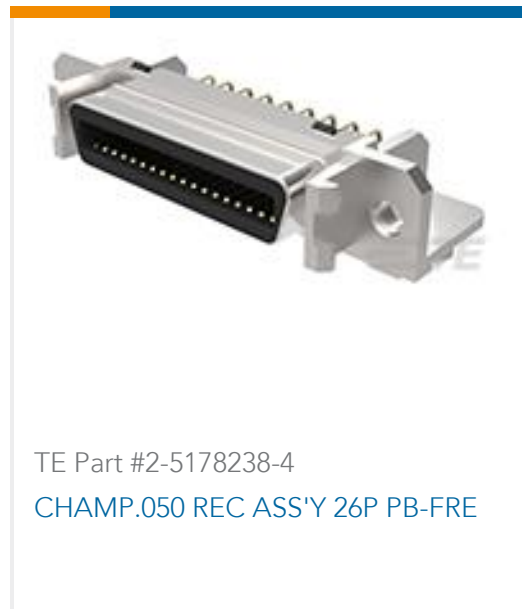
TE Part #2-5178238-4 CHAMP.050 REC ASS'Y 26P PB-FRE