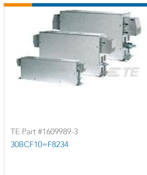
TE Part #1609989-3 30BCF10=F8234