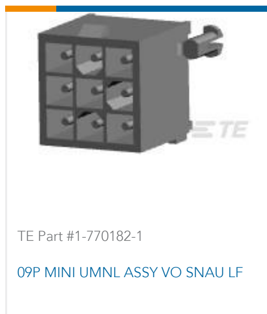
TE Part #1-770182-1 09P MINI UMNL ASSY VO SNAU LF