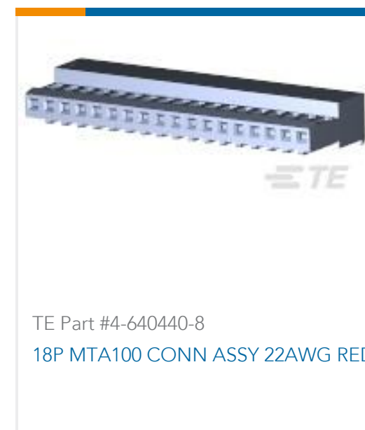
TE Part #4-640440-8 18P MTA100 CONN ASSY 22AWG RED