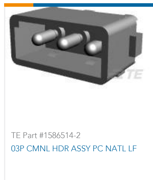
TE Part #1586514-2 03P CMNL HDR ASSY PC NATL LF