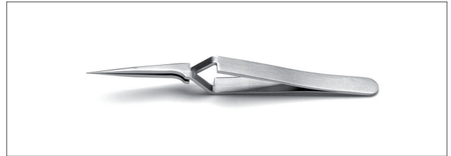
5AX.SA Tips: straight, extra fine. OAL: 110mm