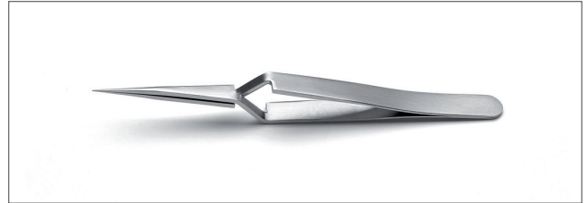
3X.SA Tips: straight, extra fine. OAL: 120mm