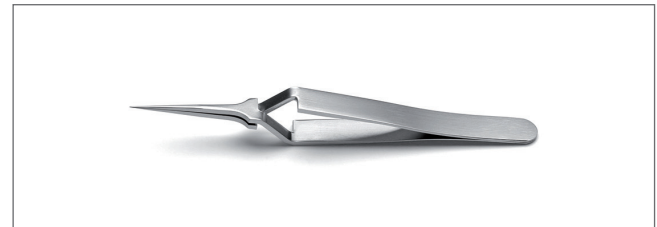
5X.SA Tips: straight, extra fine. OAL: 110mm