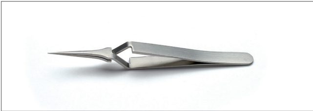
4X.SA Tips: straight, extra fine. OAL: 105mm