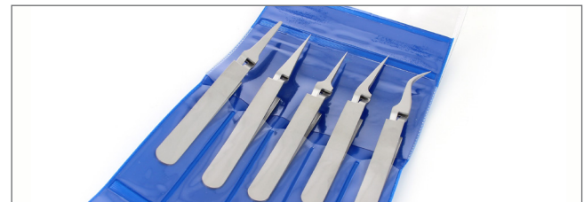
K5PINX Kit of 5 tweezers: 2AX, 3X, 5X, 5AX, 7X