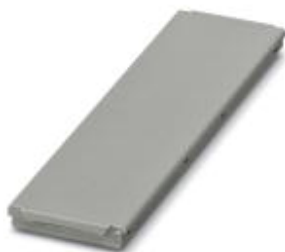
Installation component housing, Housing cover, color: light gray, width: 161.6 mm

Please be informed that the data shown in this PDF Document is generated from our Online Catalog. Please find the complete data in the user's documentation. Our General Terms of Use for Downloads are valid ( http://phoenixcontact.com/download )