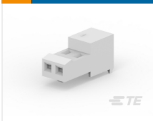
TE Part #3-640440-3 Nylon Tin Plated Receptacle: 2.54mm, No Mating Alignment, MTA 100