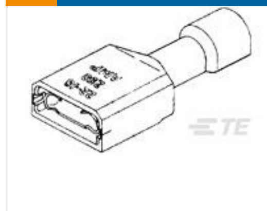
TE Part #3-350816-2 ULTRAFast 187 ASSY REC 16-14 TPBR LP