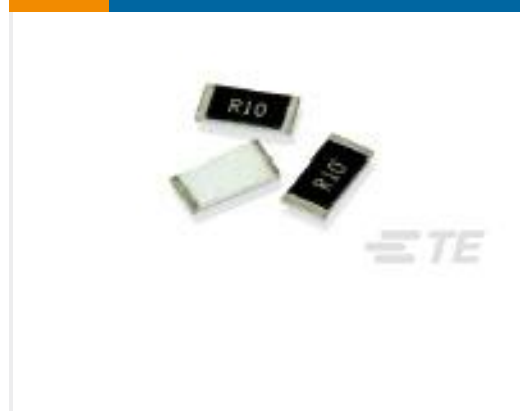
TE Part #2176053-3 RLP73M 2A R062 1% 1K RL