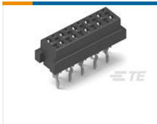
TE Part #1-2178710-4 14P, FOB, THT, MICRO-MATCH VALUE LINE