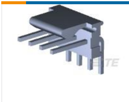
TE Part #3-641216-4 04P MTA100 HDR ASSY FL/RA LF