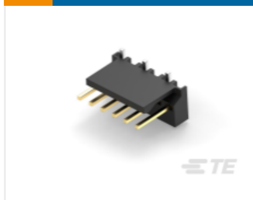
TE Part #3-647166-3 Nylon Vertical PCB Header: 2.54mm, Surface Mount, MTA 100