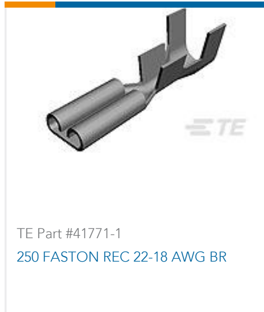
TE Part #41771-1 250 FASTON REC 22-18 AWG BR