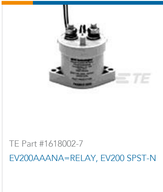
TE Part #1618002-7 EV200AAANA=RELAY, EV200 SPST-N