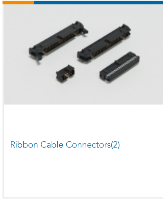
Ribbon Cable Connectors(2)