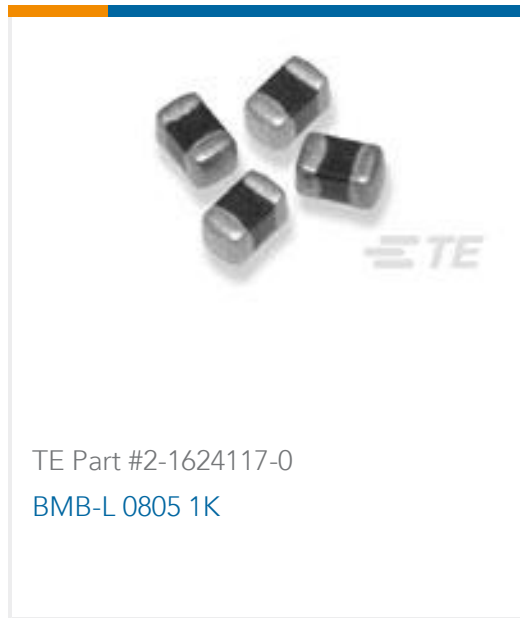
TE Part #2-1624117-0 BMB-L 0805 1K