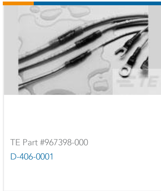
TE Part #967398-000 D-406-0001