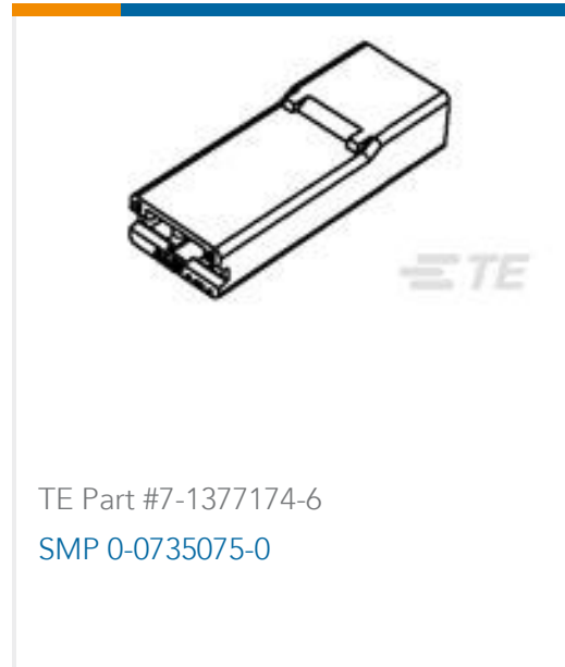
TE Part #7-1377174-6 SMP 0-0735075-0