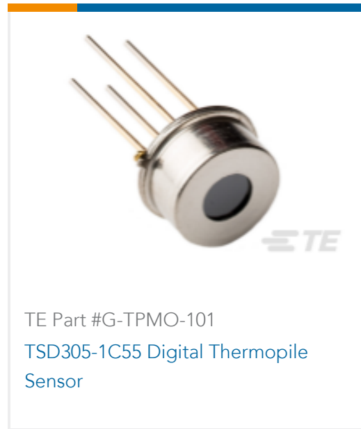
TE Part #G-TPMO-101 TSD305-1C55 Digital Thermopile Sensor