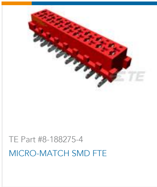
TE Part #8-188275-4 MICRO-MATCH SMD FTE