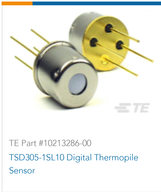
TE Part #10213286-00 TSD305-1SL10 Digital Thermopile Sensor