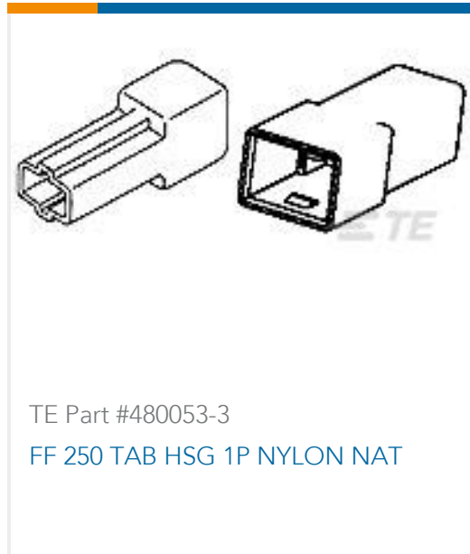
TE Part #480053-3 FF 250 TAB HSG 1P NYLON NAT