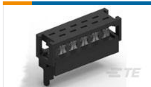
TE Part #1-2178712-2 12P, MOW, MICRO-MATCH VALUE LINE