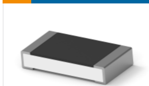
TE Part #7-2176389-3 RQ 1206 604R 0.1% 10PPM 5K RL