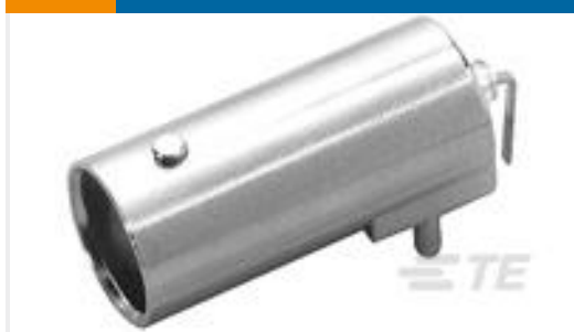
TE Part #5414373-1 JACK,PCB,50 OHM,BNC