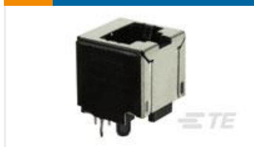
TE Part #6368150-1 MJ,TE,8P,CAT5,SHIELDED