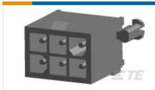
TE Part #1-770178-0 06P MINI-UMNL ASSY VO SNNI*