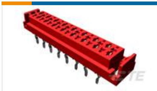
TE Part #1-338068-0 MICRO-MATCH FTE,10P