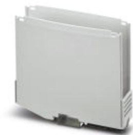
DIN rail housing, Lower part, Level 1: with vents, width: 25 mm, Cross connection: without bus connector, color: light gray (7035)

Please be informed that the data shown in this PDF Document is generated from our Online Catalog. Please find the complete data in the user's documentation. Our General Terms of Use for Downloads are valid ( http://phoenixcontact.com/download )