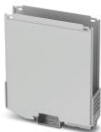
DIN rail housing, Lower part, Level 1: with vents, width: 25 mm, Cross connection: without bus connector, color: light gray (7035)

Please be informed that the data shown in this PDF Document is generated from our Online Catalog. Please find the complete data in the user's documentation. Our General Terms of Use for Downloads are valid ( http://phoenixcontact.com/download )