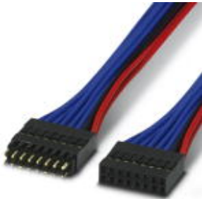
Cable bridge for cross-DIN-rail connection of the HBUS connector

Please be informed that the data shown in this PDF Document is generated from our Online Catalog. Please find the complete data in the user's documentation. Our General Terms of Use for Downloads are valid ( http://phoenixcontact.com/download )