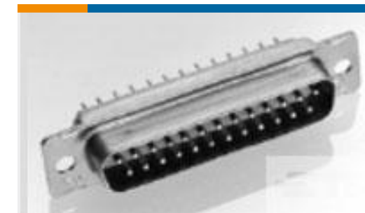
TE Part #204509-1 AMPLIMITE,ASY,PLUG,STD,90,5