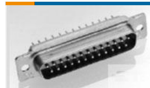
TE Part #204508-1 RECEPT ASSY,78 POSN,AMPLIMITE