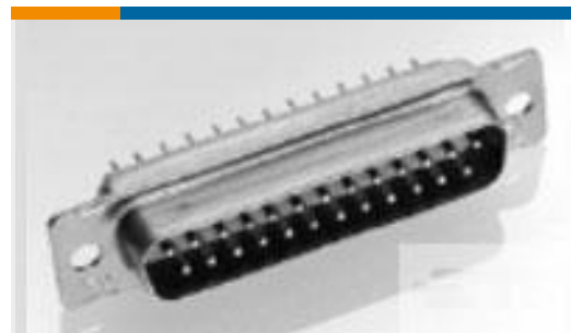
TE Part #204502-1 RECEPT ASSY,26 POSN,AMPLIMITE