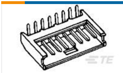
TE Part #280378-1 4P AMPMODU II SHRD HDR, RT ANG, TIN