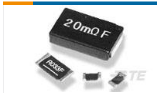
TE Part #1879378-2 TLR 2512 3.0W R001 1% 50PPM 2K RL