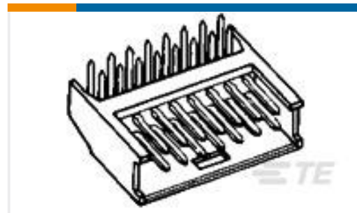
TE Part #280389-2 2X4P MODU II SHRD HDR, RT ANG, 0.38AU