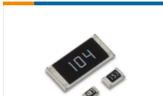
TE Part #2-2176345-3 CRGCQ 1210 680R 1%