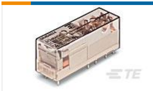
TE Part #3-1415055-1 SR4D4024