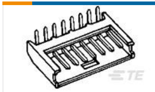
TE Part #280377-1 2P AMPMODU II SHRD HDR, RT ANG, TIN