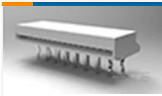
TE Part # 2-84983-4 1mm FFC DIP H ASSY 24P TUBE