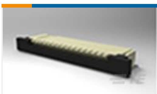
TE Part # 2-84953-2 1MM FPC HORZ.TOP CONT.ASSY 22P