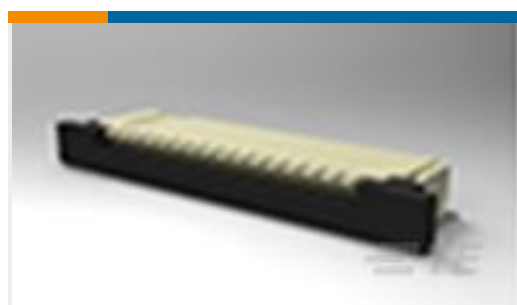
TE Part # 2-84953-0 1MM FPC HORZ.TOP CONT.ASSY 20P