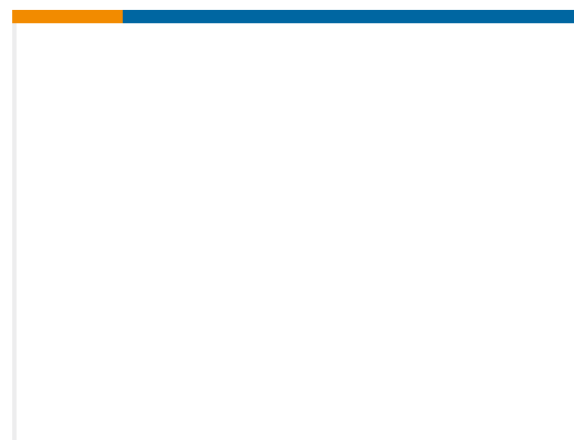
TE Part #171363-1 MULTI INTERLOCK CONN HSG