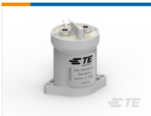
TE Part #2203194-1 EVC135, RELAY, SPST NO