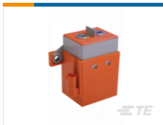
TE Part #2306649-1 V23720A0002A001-SZ-CBOX