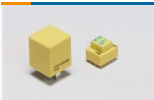
Automotive High Voltage Relays(2)