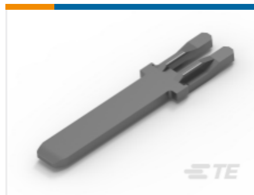
TE Part #2336813-2 TAB 2,8X0,8 ACT PIN