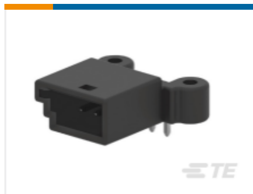
TE Part #174055-2 SIGNAL HEADER