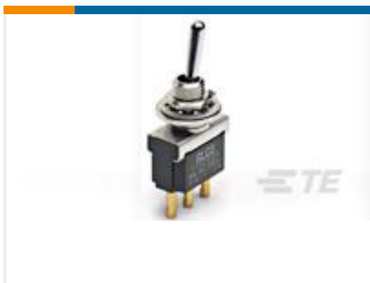
TE Part #2-6437630-0 FTD0904=MINIATURE TOGGLE