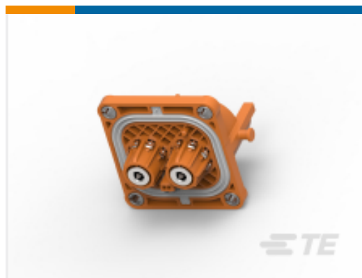
TE Part #2141227-1 2POS,PIN DIA 8.0,PIN HSG,ASSY,SLD