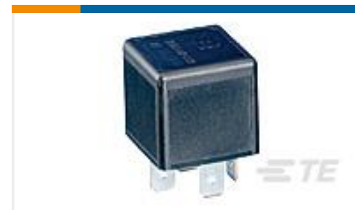
TE Part #7-1904094-5 V23134B0053C642-SZ-CBOX