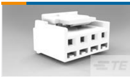
TE Part #2132781-4 04P EP-II HOUSING, NATURAL