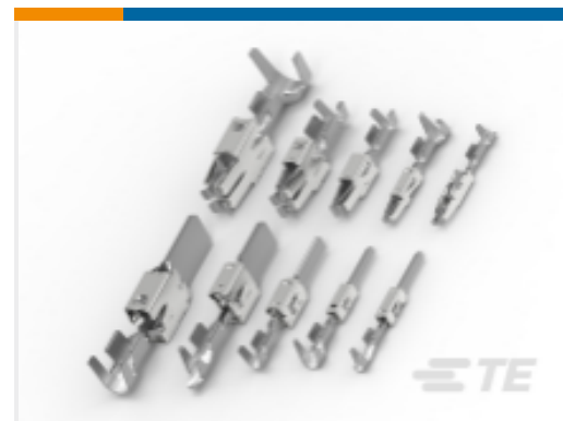
TE Part #963774-1 TIMER, RECEPTACLE AND TAB