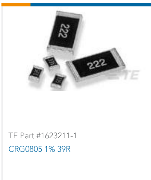
TE Part #1623211-1 CRG0805 1% 39R