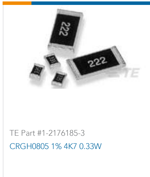
TE Part #1-2176185-3 CRGH0805 1% 4K7 0.33W