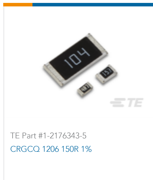
TE Part #1-2176343-5 CRGCQ 1206 150R 1%