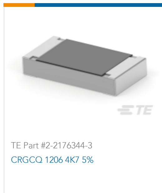
TE Part #2-2176344-3 CRGCQ 1206 4K7 5%