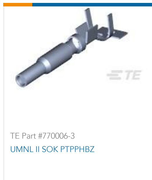
TE Part #770006-3 UMNLI II SOK PTPPHBZ