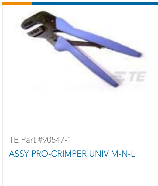
TE Part #90547-1 ASSY PRO-CRIMPER UNIV M-N-L