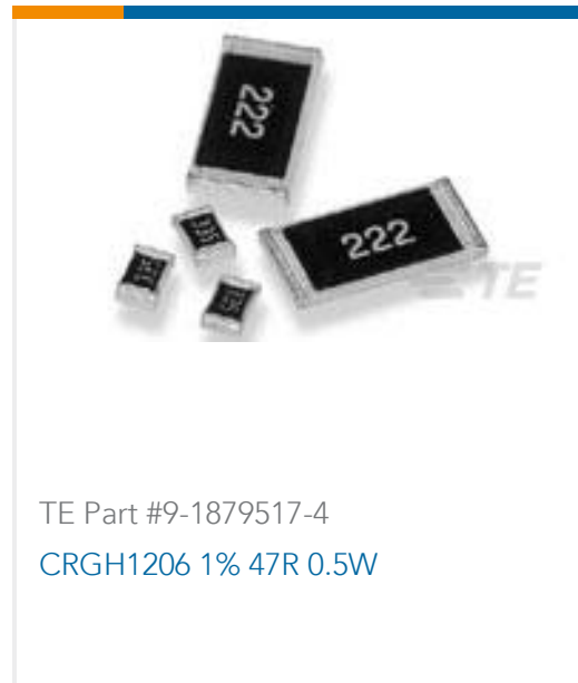
TE Part #9-1879517-4 CRGH1206 1% 47R 0.5W