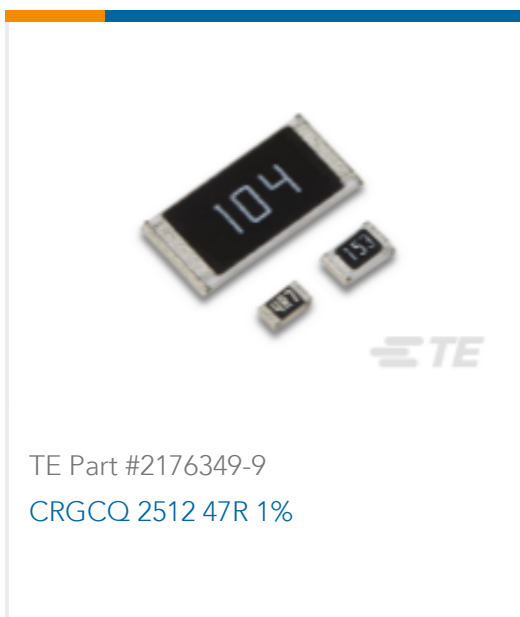
TE Part #2176349-9 CRGCQ 2512 47R 1%