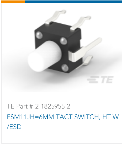
TE Part # 2-1825955-2 FSM11JH=6MM TACT SWITCH, HT W /ESD