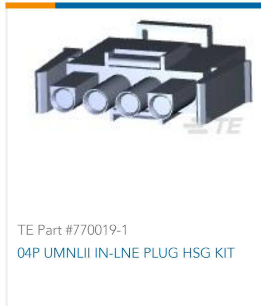
TE Part #770019-1 04P UMNLI IN-LNE PLUG HSG KIT