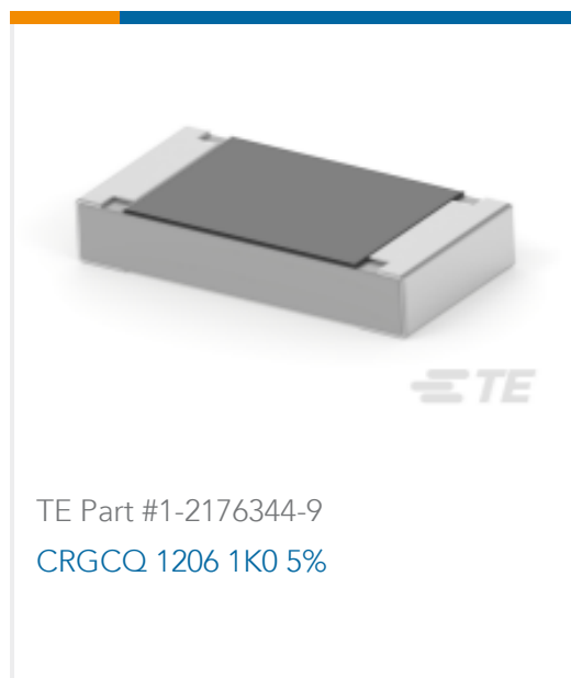
TE Part #1-2176344-9 CRGCQ 1206 1K0 5%