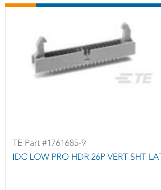
TE Part #1761685-9 IDC LOW PRO HDR 26P VERT SHT LAT