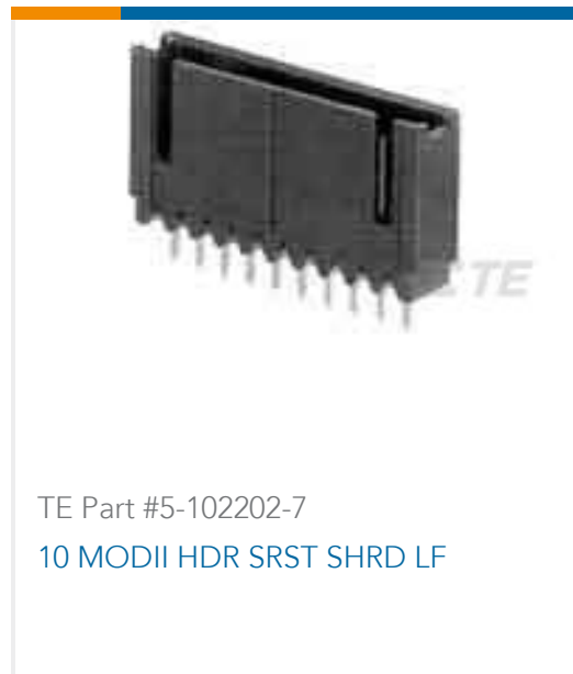
TE Part #5-102202-7 10 MODII HDR SRST SHRD LF