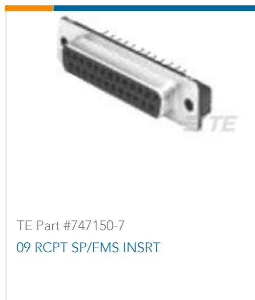
TE Part #747150-7 09 RCPT SP/FMS INSRT