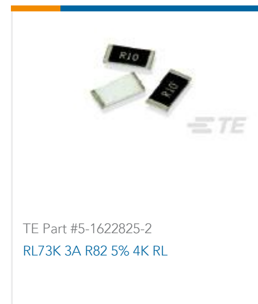
TE Part #5-1622825-2 RL73K 3A R82 5% 4K RL