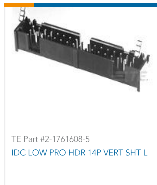
TE Part #2-1761608-5 IDC LOW PRO HDR 14P VERT SHT L