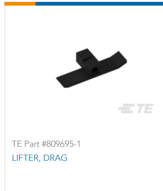
TE Part #809695-1 LIFTER, DRAG