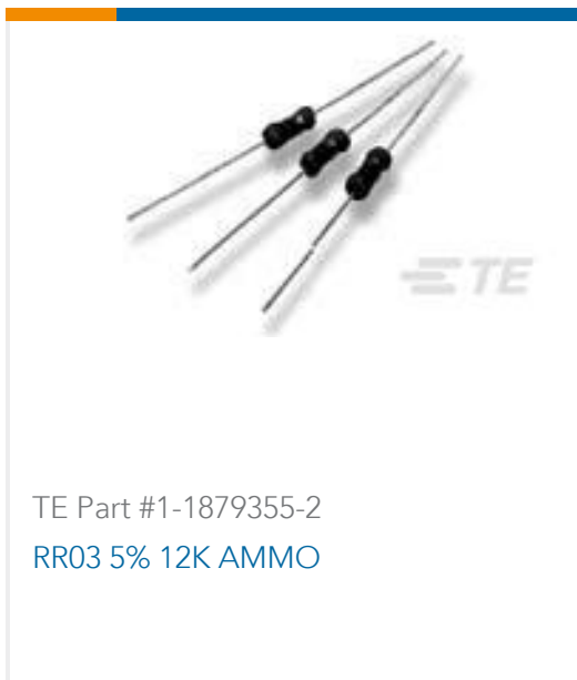
TE Part #1-1879355-2 RR03 5% 12K AMMO