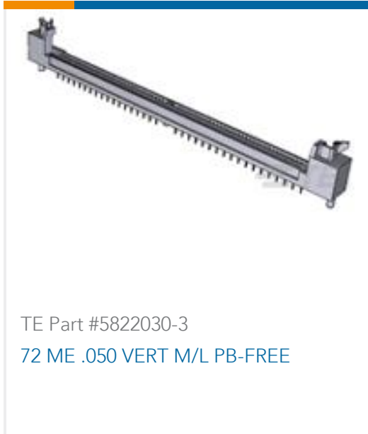
TE Part #5822030-3 72 ME .050 VERT M/L PB-FREE