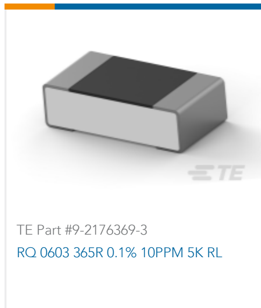
TE Part #9-2176369-3 RQ 0603 365R 0.1% 10PPM 5K RL