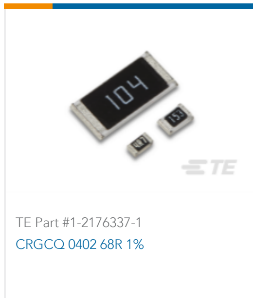
TE Part #1-2176337-1 CRGCO 0402 68R 1%