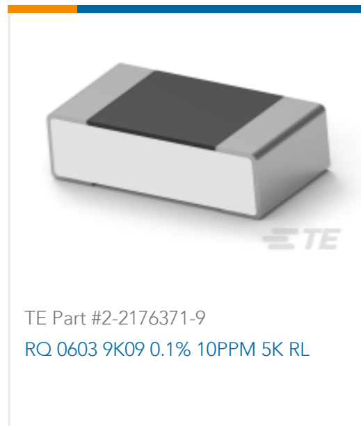
TE Part #2-2176371-9 RQ 0603 9K09 0.1% 10PPM 5K RL