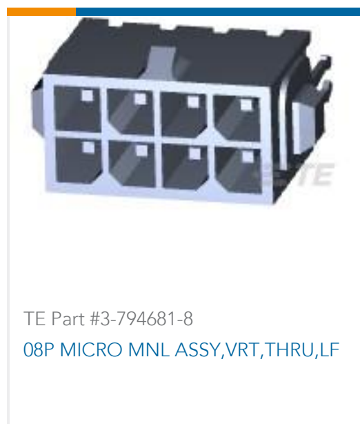
TE Part #3-794681-8 08P MICRO MNL ASSY,VRT,THRU,LF