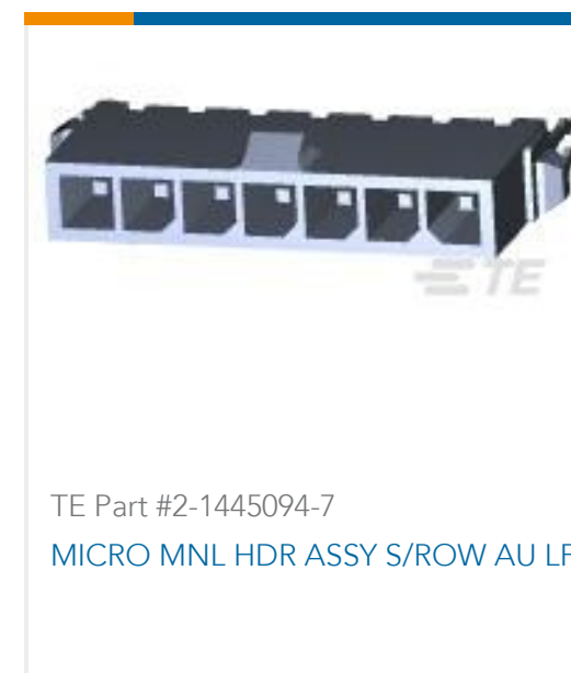
TE Part #2-1445094-7 MICRO MNL HDR ASSY S/ROW AU LF