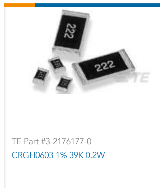
TE Part #3-2176177-0 CRGH0603 1% 39K 0.2W