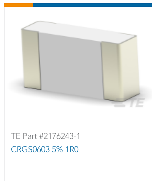
TE Part #2176243-1 CRGS0603 5% 1R0