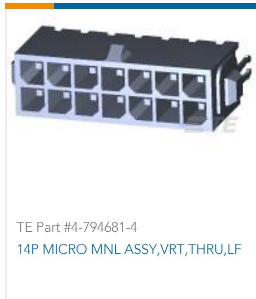
TE Part #4-794681-4 14P MICRO MNL ASSY,VRT,THRU,LF