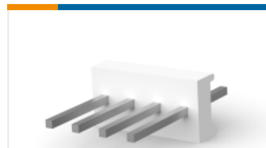
TE Part #640456-2 Polyester Vertical PCB Header: 2.54 mm, Unshrouded, No Mating Alignment