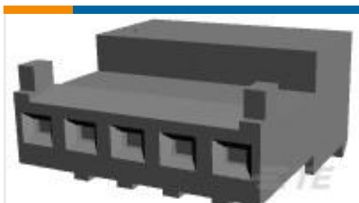
TE Part #3-643814-5 05P MTA100 CONN ASSY POL RIB