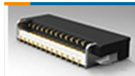
TE Part #2-2040832-1 EMBOSS TAPING 0.25FPC BF-L-1.3