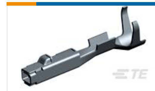
TE Part #1418850-1 MCON 1.2 CB REC SWS SN