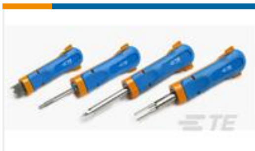
TE Part #5-1579007-3 EXTRACTION TOOL