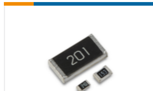
TE Part #2-2176327-8 CRGP 0805 1K8 1%