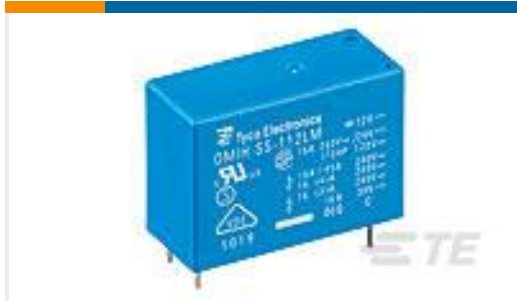
TE Part #6-1440000-9 OMIH-SH-112D,394