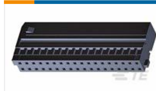
TE Part #1355930-2 BU-GEH 36P,HELLBLAU