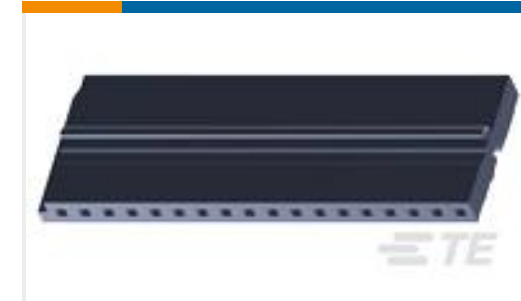
TE Part #1355929-2 BU-GEH 18P