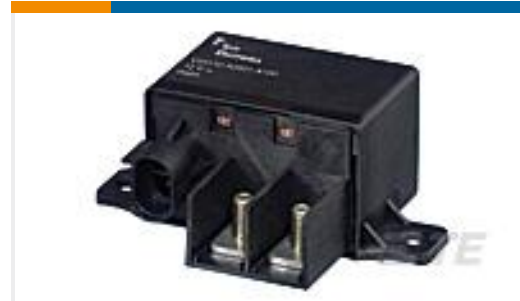
TE Part #1393315-9 V23132B2002A200=HCR