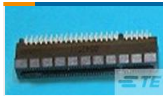
TE Part #5650118-3 CONN SEC II 6 POS 100C/L R/A