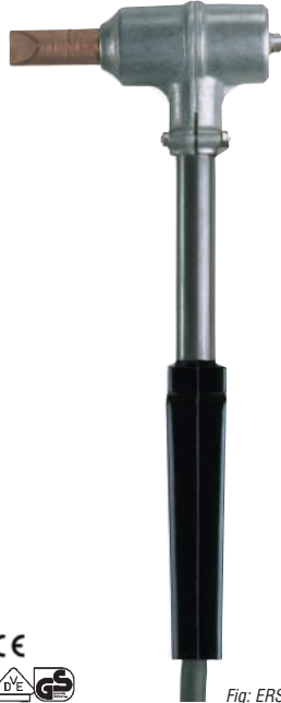
Fig: ERSA 200 MZ