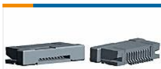
TE Part #3-1734592-7 FPC CONN. 0.5MM PITCH B/C, 37P