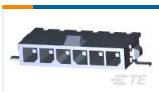
TE Part #2-1445057-6 MICRO MNL HDR ASSY SINGLE ROW