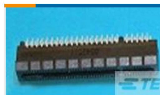
TE Part #5650118-3 CONN SEC II 6 POS 100C/L R/A