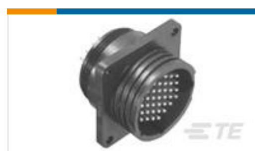
TE Part #207825-9 CPC RCPT ASSEMBLY SIZE 11-4