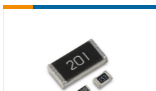
TE Part #1-2176328-1 CRGP 1206 68R 1%