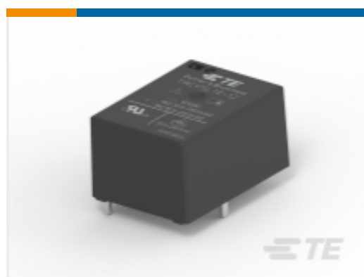
TE Part #1558661-3 T9GV1L14-12