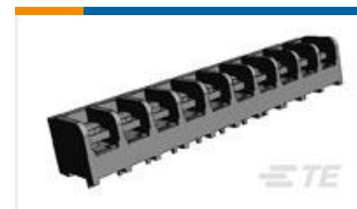
TE Part #3-1437653-5 6PCV-10-006=6PCV ASSEMBLY