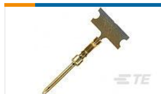
TE Part #745254-2 20DF PIN CONTACT,PLATED