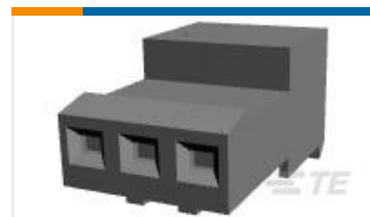
TE Part #3-643498-3 03P MTA100 CONN ASSY LF