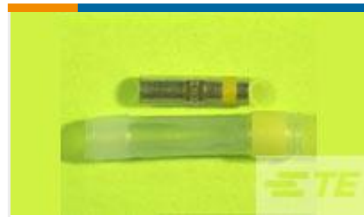
TE Part #650087-000 D-436-26