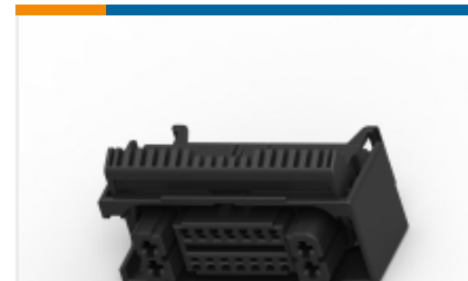
TE Part #1-2112780-9 18POS, MIXED, REC HSG, ASSY, SEALED