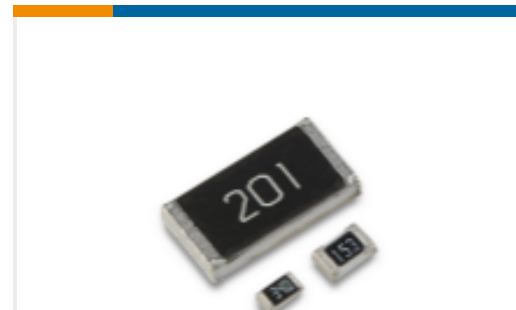
TE Part #4-2176325-9 CRGP 0402 100K 1%