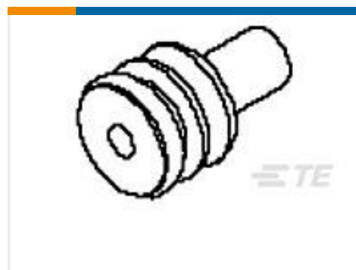
TE Part #184139-1 WIRE SEAL, RUBBER, SENSOR, BLUE