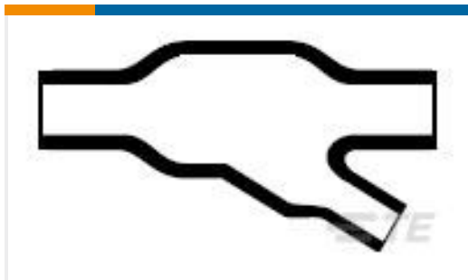
TE Part #820131-000 362A014-25-0