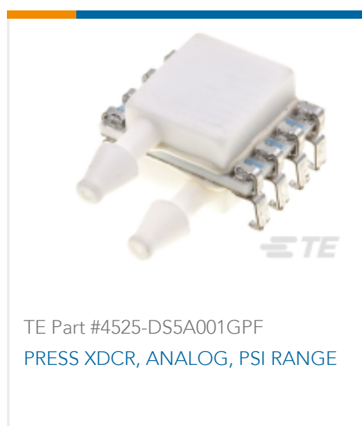
TE Part #4525-DS5A001GPF PRESS XDCR, ANALOG, PSI RANGE