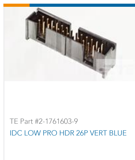
TE Part #2-1761603-9 IDC LOW PRO HDR 26P VERT BLUE