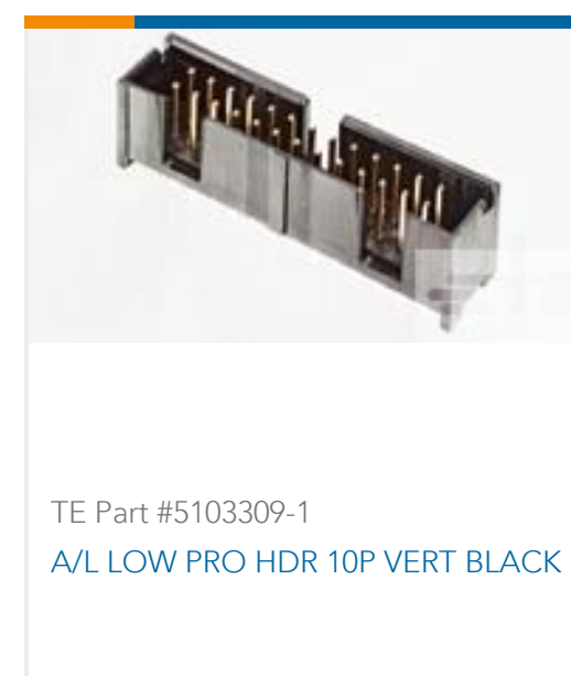
TE Part #5103309-1 A/L LOW PRO HDR 10P VERT BLACK