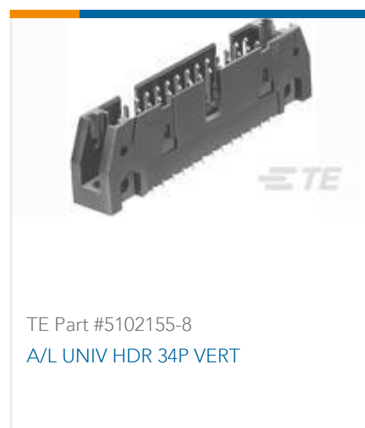
TE Part #5102155-8 A/L UNIV HDR 34P VERT