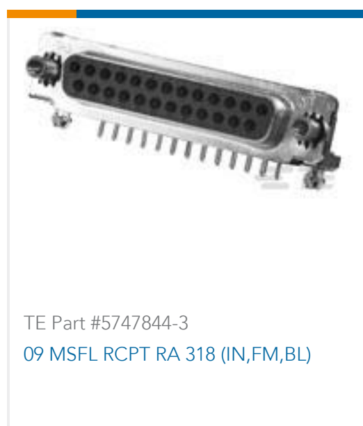
TE Part #5747844-3 09 MSFL RCPT RA 318 (IN,FM,BL)