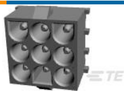
TE Part #350712-4 09P UMNL PIN HDR ASSY 94VO LF