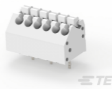
TE Part #9-2834026-7 6P 3.5MM TOP-E MSC_YW/GY/BE/RD /PE/GY