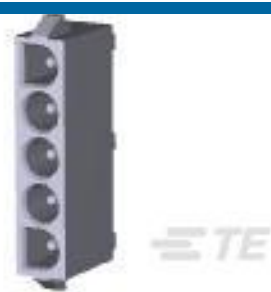
TE Part #640900-3 05P UMNL PIN HDR ASSY 94VO LF