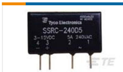
TE Part #5-1393030-8 SSRC SRS,THT,5A,240V AC -DC I/P