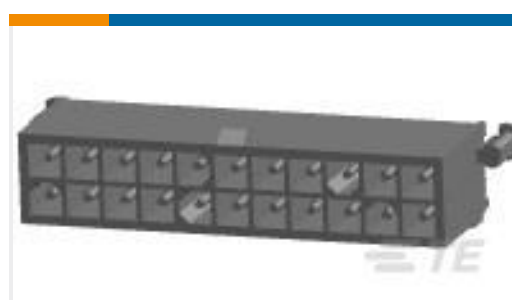
TE Part #1-794071-1 22P MINI UMNL HDR W/DH AU LF